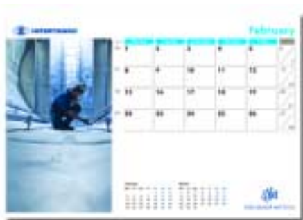
The INTERTANKO Calendar