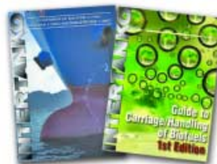
INTERTANKO Special publications