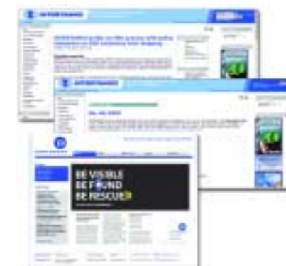
INTERTANKO Weekly News