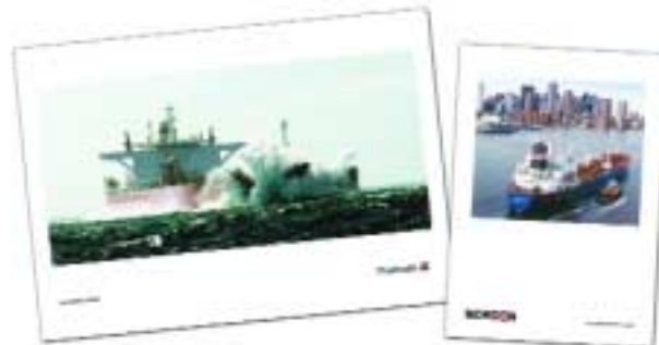
The INTERTANKO Annual Review and Report